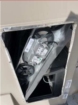
GENERAL Assigned To AC2 Final OA position.