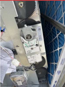
GENERAL Assigned To AC1 Final OA position